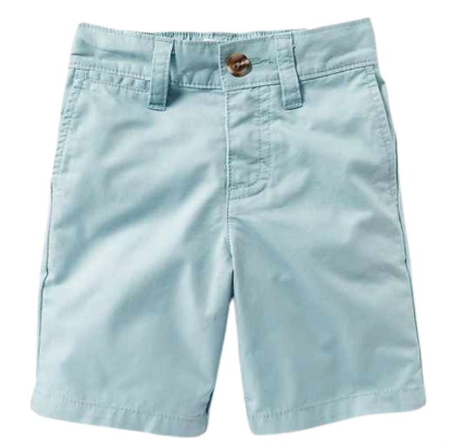
Garment Dyed Chino Short 20 x 16 Spandex