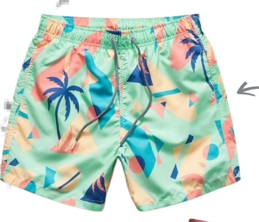
Pigment Print Short 30 x 20 Spandex 2/1