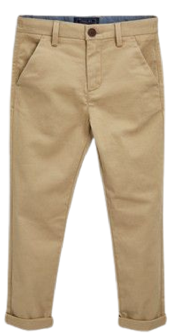
Reactive Dyed Chino 30 x 20 Spandex 2/1