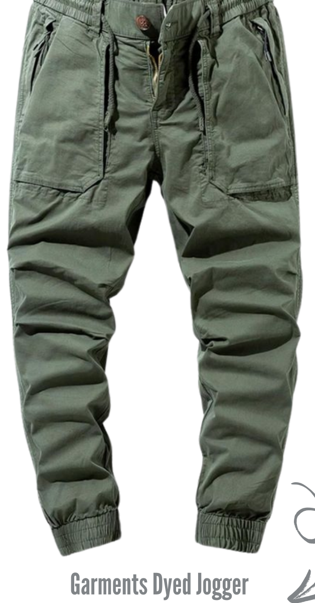
30 x 20 Spandex 2/1